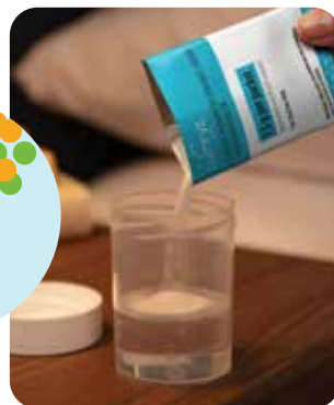
Each dosage strength comes in a different-color packet.